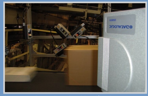
Automated warehousing identification systems